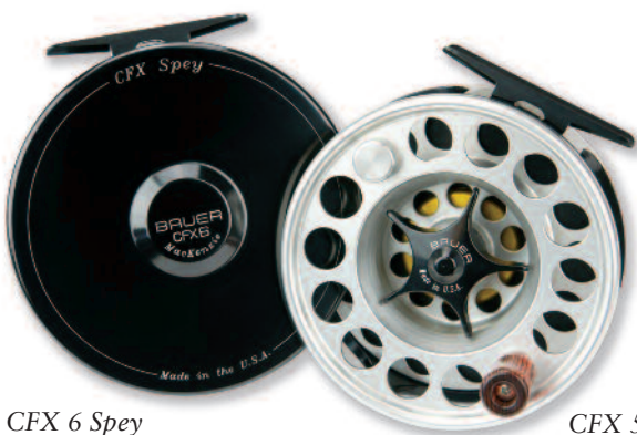
CFX 6 Spey

The CFX Spey has a traditional solid back frame with a Jet Black high polish mirror finish. Built on the CFX platform, the sealed carbon fiber drag system delivers silky smooth performance at all settings and in all conditions—no maintenance required. The CFX Spey is traditional in appearance but high tech in performance. A perfect match for the great mid-price switch and two-handed rods available today.